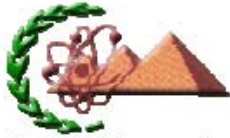
Atomic Energy Authority